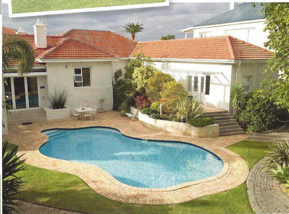
ABOVE: Tall trees, beautiful flowers and lush green lawns are part of what makes Cedar Garden B&B so delightful. TOP: The secluded courtyard garden of First Avenue Lodge is not far from the bustle of Hobie Beach in Port Elizabeth.

This child- and wheelchair-friendly home has secure off-street parking, a guest lounge with DSTv, information brochures and is a short walk away from the tourist information centre.